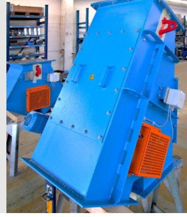
2- to 3- way distributor